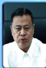
Hon. Jonas Leones UnderSecretary, Department of Environment and Natural Resources Republic of the Philippines